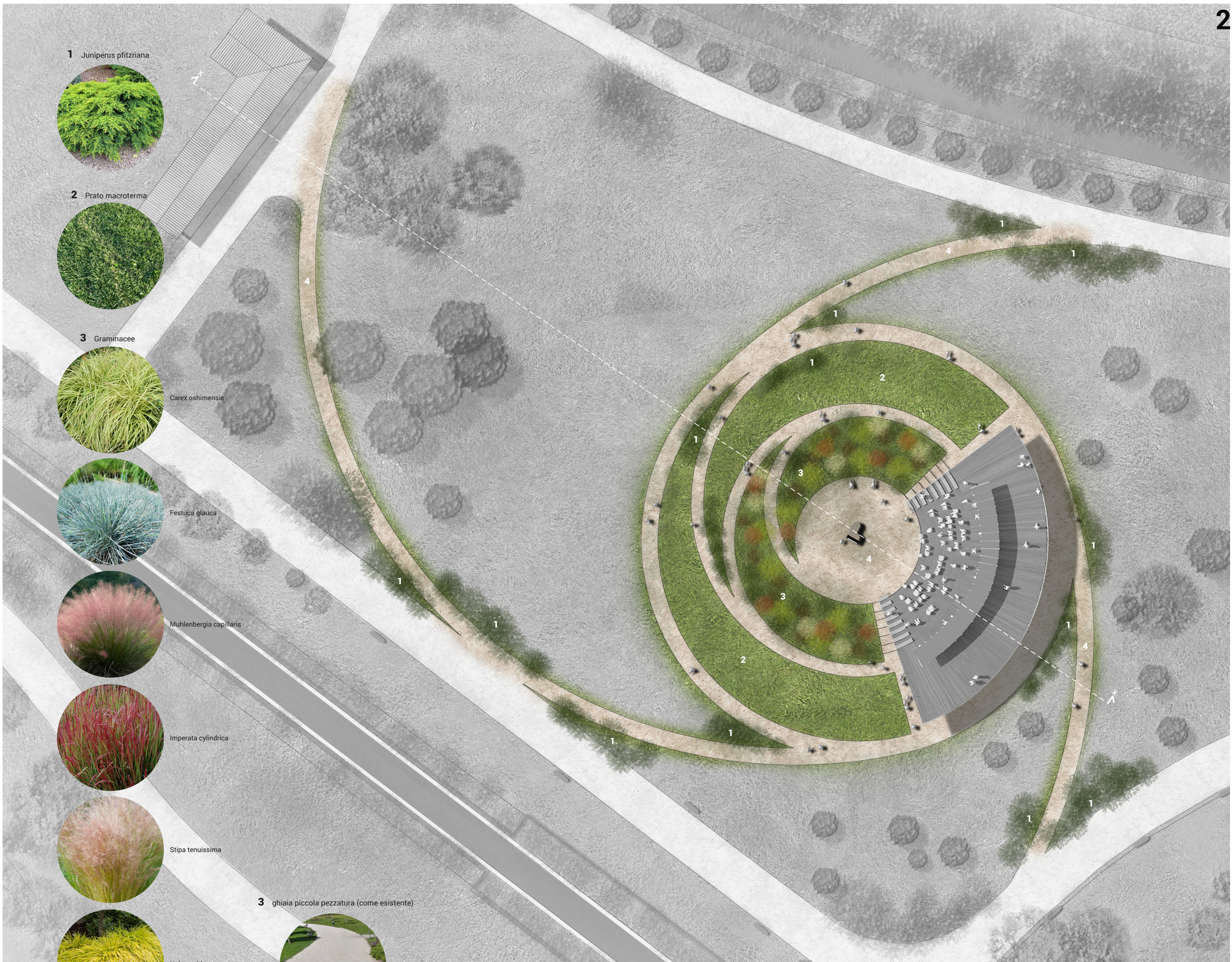
PLANIMETRIA GENERALE scala 1:250